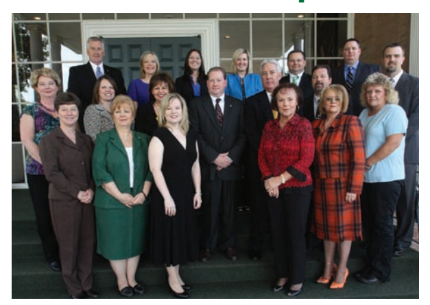
19 employees graduated in Austin Bank Leadership Class of 2010